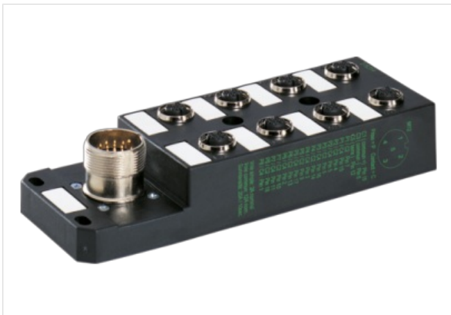
Product van afwijken van afbeelding